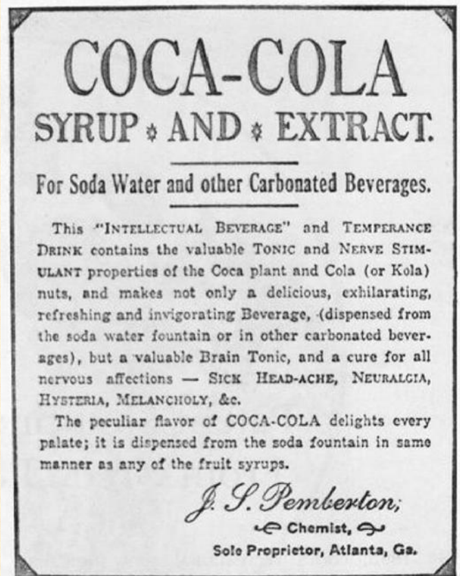
An early Coca-Cola advertisement

It may be strange, but it is important to acknowledge our modern-day connections to the Civil War are really not that far removed from our daily lives.