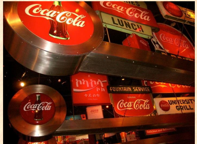
Advertising signs at the Coca-Cola Museum, Atlanta

John S. Pemberton served as lieutenant colonel of the 3rd Georgia Cavalry Reserves as a part of the Confederate States Army. He was hit in the chest with a saber in the battle of Columbus, Georgia, fought April 16, 1865—seven days after Lee surrendered at Appomattox. It was a painful and lingering wound.