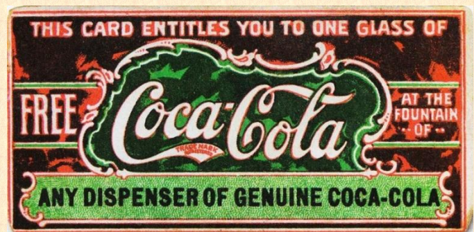
Believed to be the first coupon ever, this ticket for a free glass of Coca-Cola was first distributed in 1888 to help promote the drink.