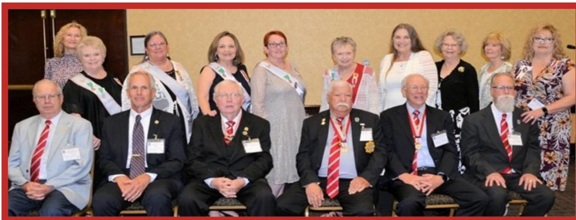
Seated are the officers of the Texas Society of the MOS&B Back row are the officers of the National Society Daughters of CSA Officer Corps