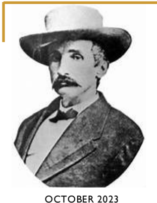
Major Benjamin F. Ficklin Chapter 310 - San Angelo